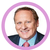
Hon Don Punch MLA Minister for Disability Services

I am pleased to present the WA Disability Royal Commission Implementation Roadmap. I look forward to continuing to partner with people with disability, their families, carers and supporters, to deliver these crucial reforms.