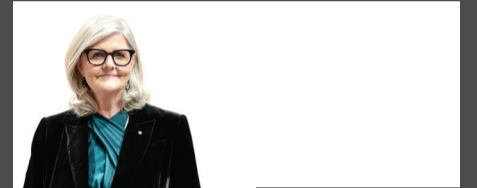
Her Excellency the Hon Ms Sam Mostyn AC