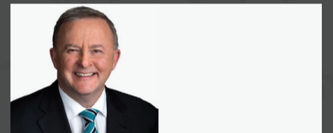
The Hon Anthony Albanese MP