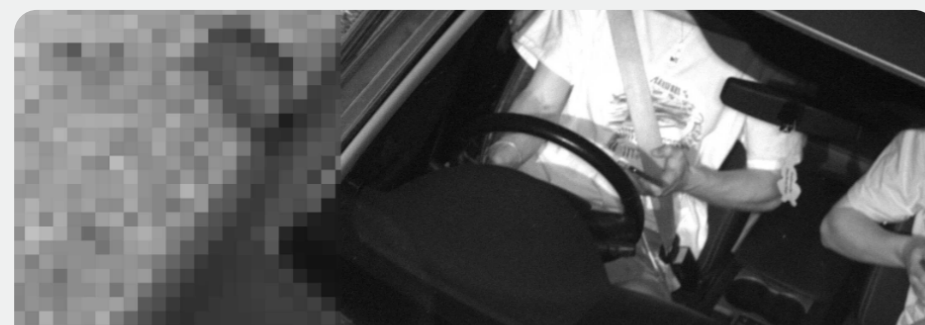
Mobile phone detection, 110km/h speed limit, Albany Highway, North Bannister

The total number of vehicles detected during the trial was the equivalent of detecting every vehicle in WA three times each.*