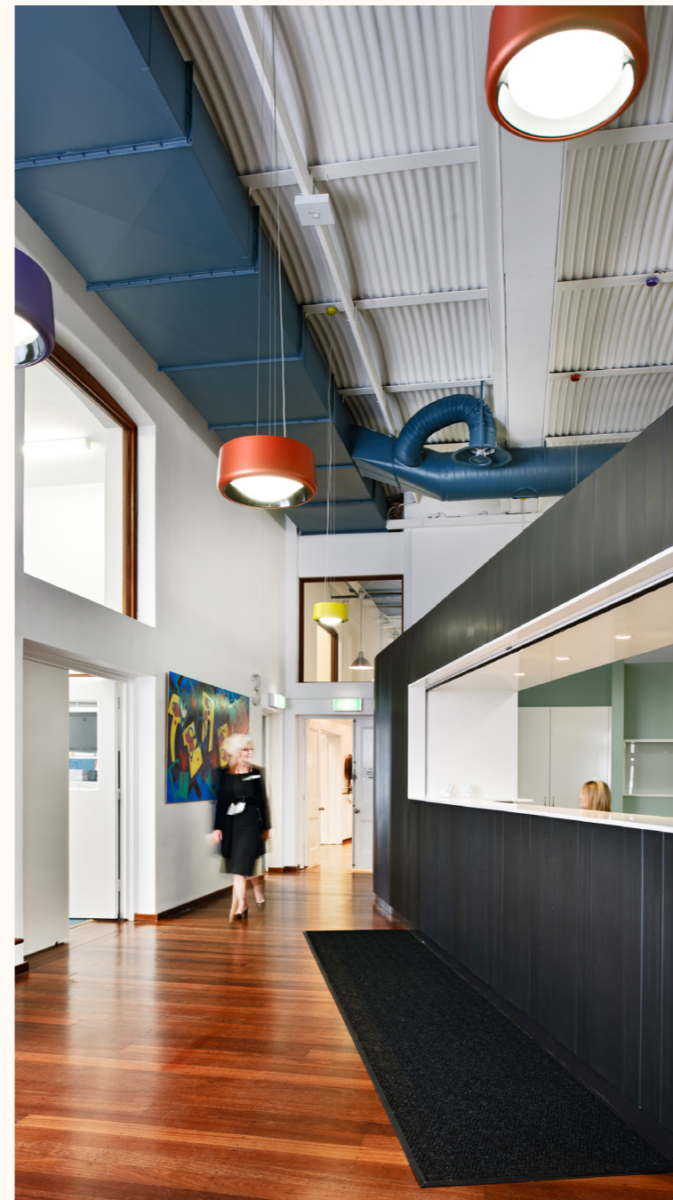
ABOVE: Princess May Girls School, Fremantle (1911): Structurally independent modules ensured minimal disruption to the original fabric of this historic building, which is now the Fremantle Education Centre.

We have a range of publications and examples on our website that show how heritage places have been transformed through conservation and sensitive development.