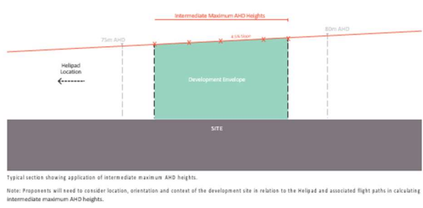
Figure 1.4 Intermediate Maximum AHD Heights Royal Perth Hospital Flight Path

Date: 27 Jan 2022 | Scale: 1:25000 A1 | 1:25000 A1 | File: 19-1318-CP-4 | SWP1-01-CR | Checked: G3