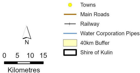
Strategic Community Water Supplies