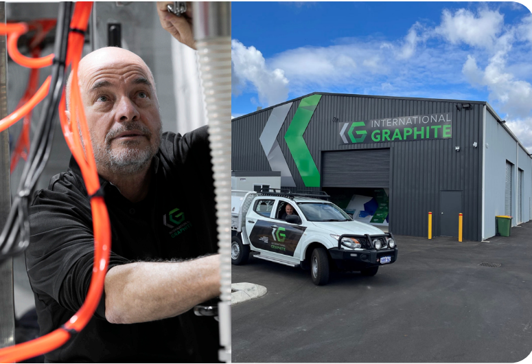
Above: International Graphite pilot plant in Collie's Light Industrial Area

International Graphite continues to push ahead with plans to establish in town, with $6.5 million in new funding from the WA Government to support the next phase of the company's proposed graphite micronising processing facility in Collie.