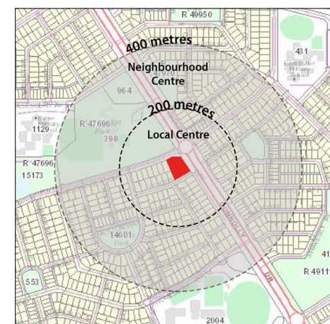
Figure B: Location in relation to a local and neighbourhood centre