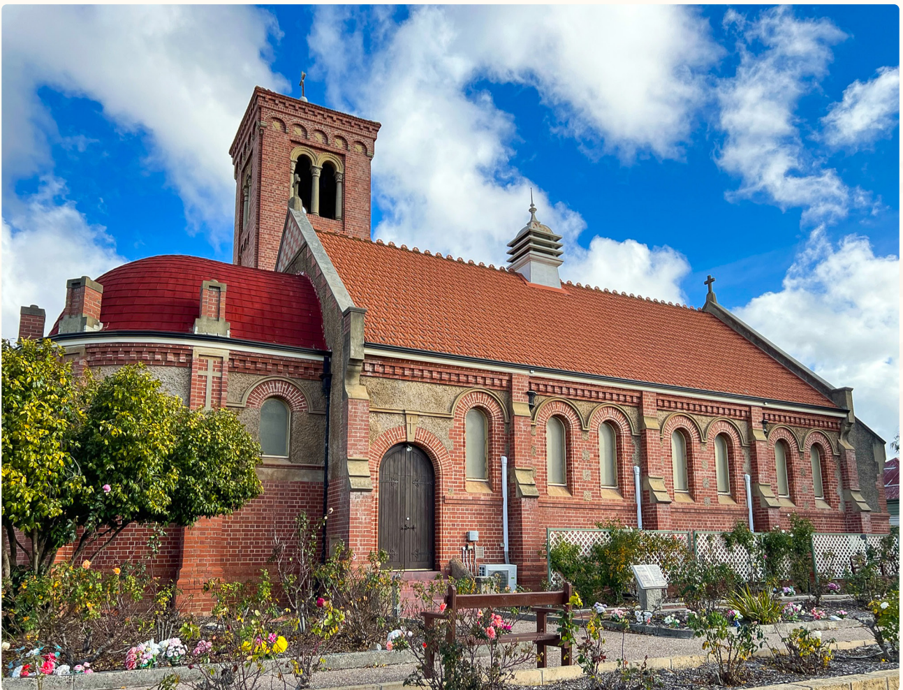
ABOVE: All Saints' Anglican Church, Collie P552 2021-22 SHG recipient for Conservation Management Plan and works to the belfry.