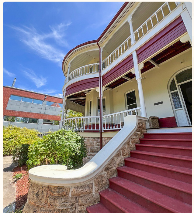
ABOVE: Windsor Hall P3320

2022-23 SHG recipient for water ingress, drainage works and timber and masonry repairs.