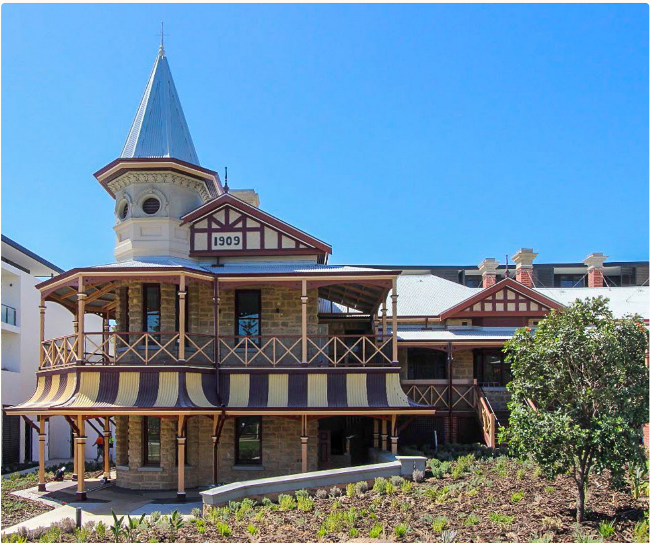
ABOVE: Wearne Hostel, Cottesloe P603

Projects that fail to adequately demonstrate hardship will be assessed and recommended with the standard funding ratio.