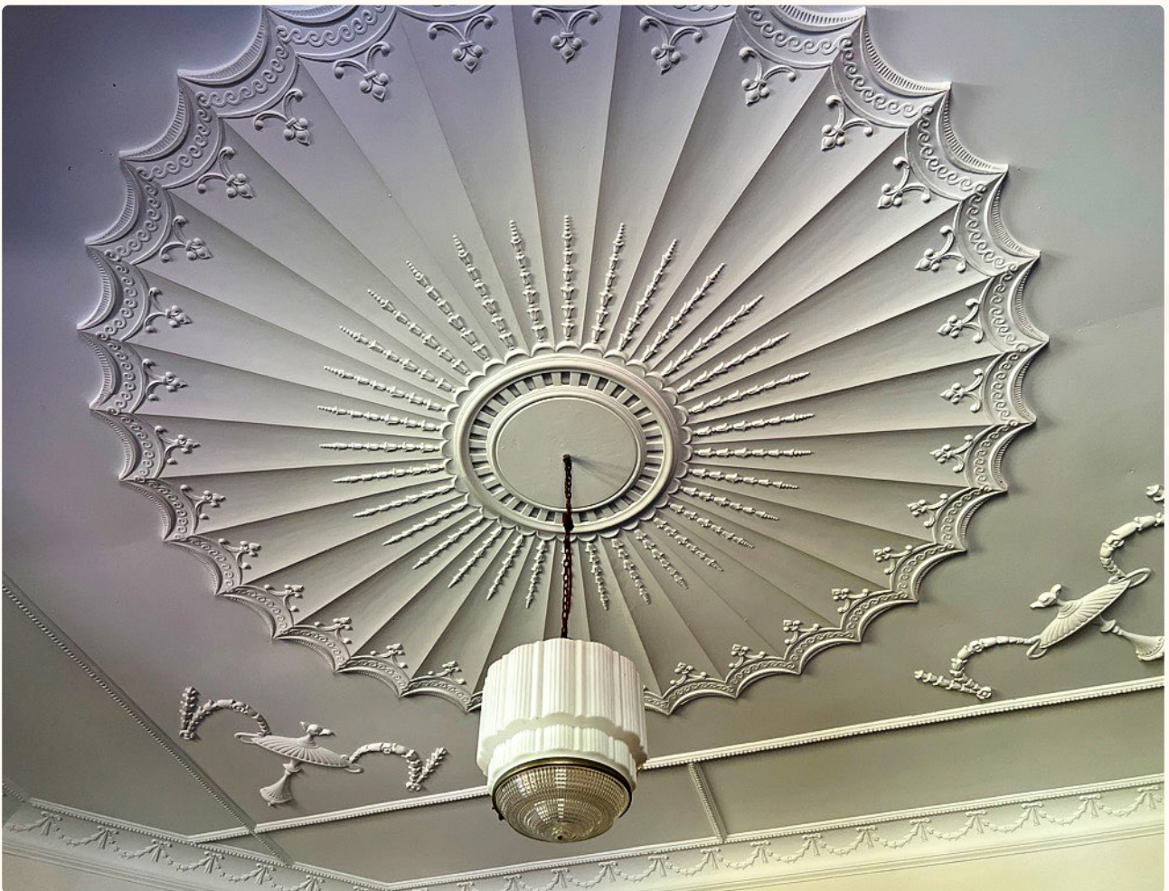
ABOVE: Windsor Hall P3320

2022-23 SHG recipient for water ingress, drainage works and timber and masonry repairs.