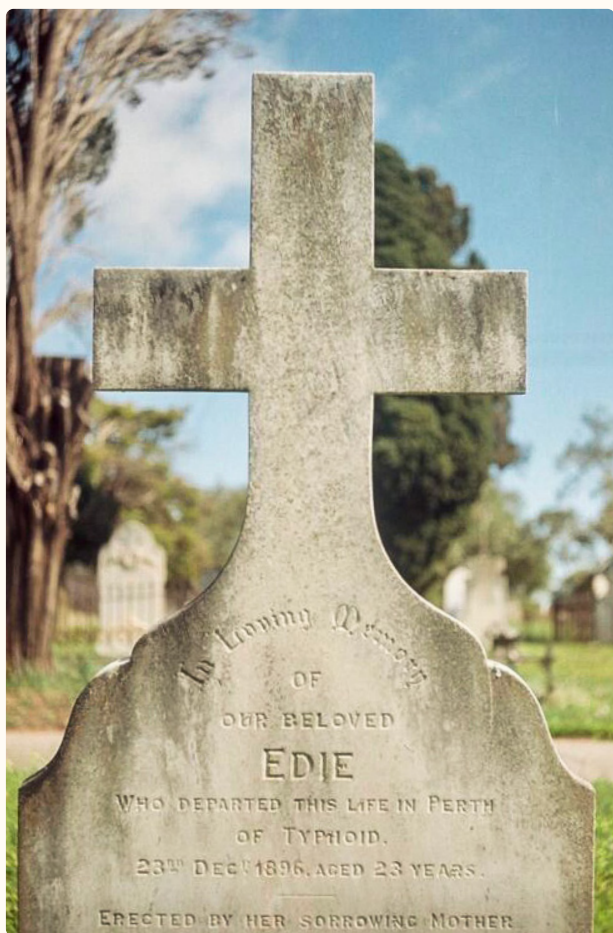
ABOVE: East Perth Cemeteries P2164

2022-23 CHG recipient for the development of an audio project of the history and landscape of East Perth Cemeteries.