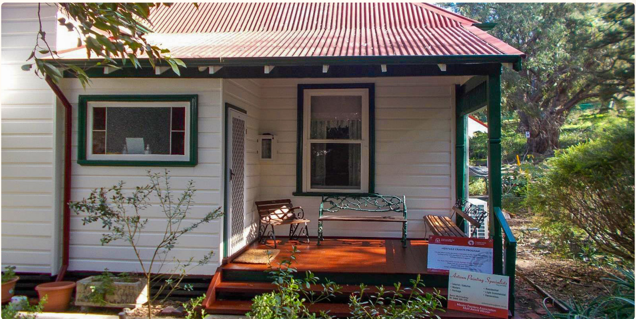
ABOVE: Tom Collins House, Allen Park P2368

2022-23 SHG recipient for painting to the interior and exterior.