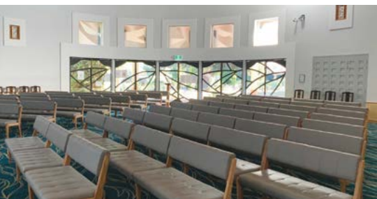
The Norfolk is the largest chapel at Karrakatta Cemetery

All indoor chapels are air conditioned and possess high quality sound systems.