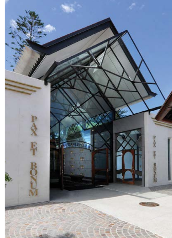
All Saints Mausoleum features St. Francis Chapel