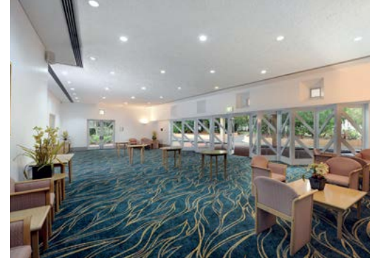
Brown Condolence Lounge