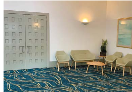
Dench Condolence Lounge