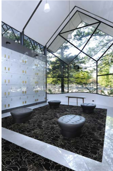
St. Francis Chapel

Crypts are available for pre-purchase or at the time of need. For more information or to request a copy of our mausoleum brochure contact Client Services at Karrakatta on 1300 793 109. Information regarding the mausoleums can also be downloaded from our website at www.mcb.wa.gov.au .