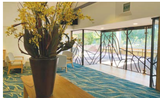
Norfolk Condolence Lounge

IN THE EVENT OF LARGER CROWDS THE CHAPEL HAS SCREENS FOR VIEWING THE SERVICE IN THE OUTDOOR AREA.