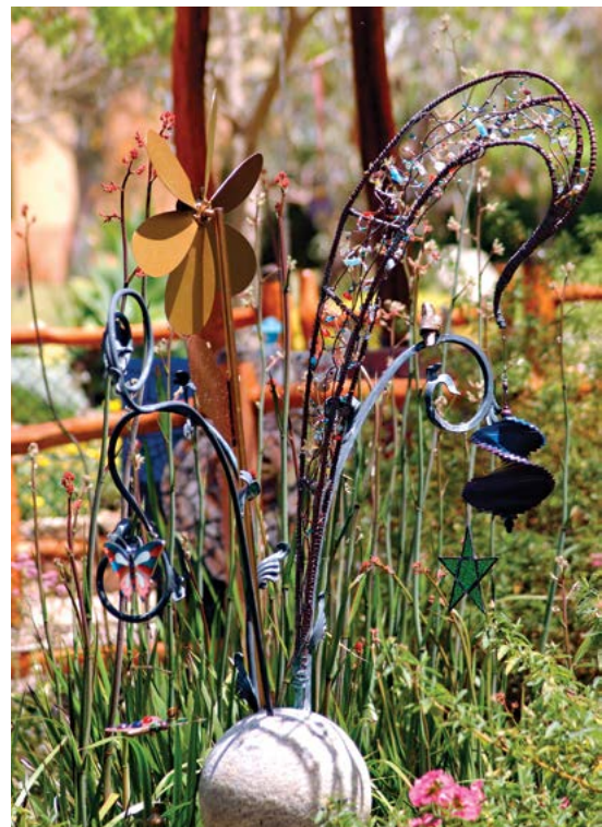
Sculpture in the Infant's Butterfly Garden

A children's memorial garden is located adjacent to the burial area, enabling memorial plaques to be placed following cremation.