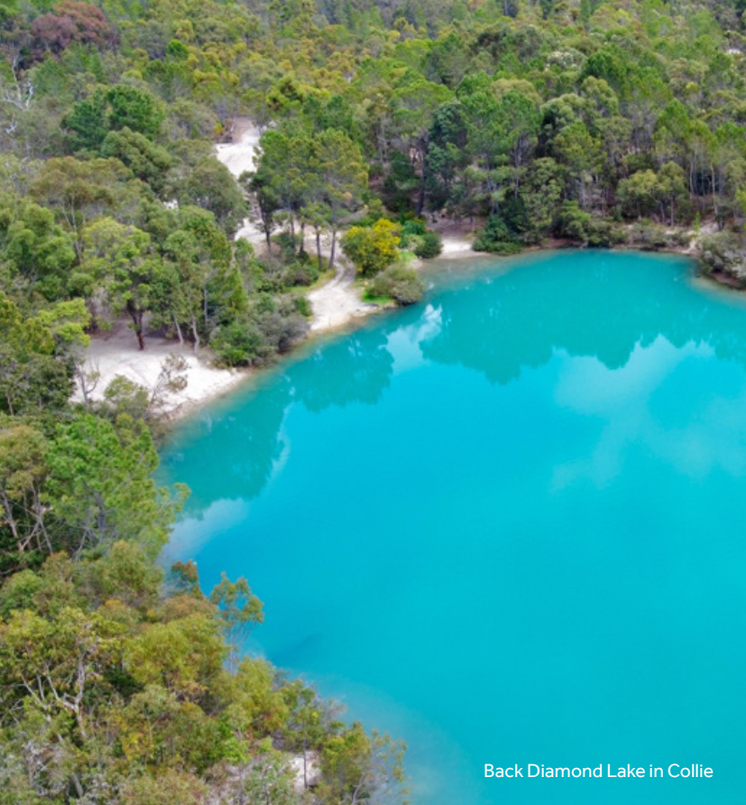
Back Diamond Lake in Collie