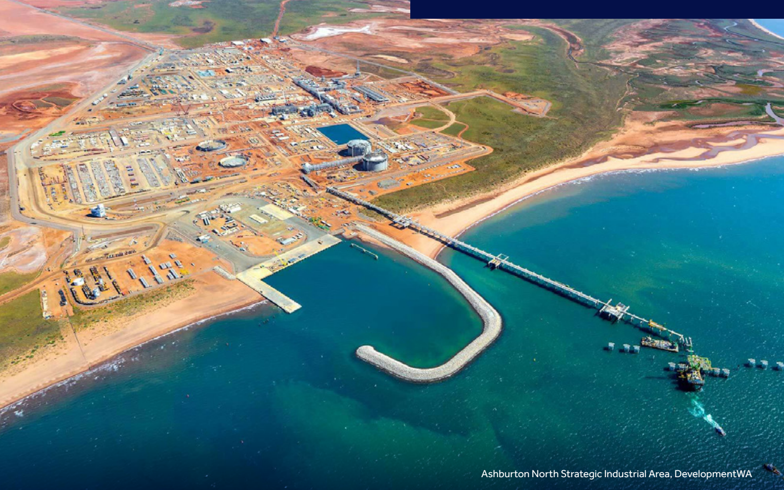
Ashburton North Strategic Industrial Area, DevelopmentWA