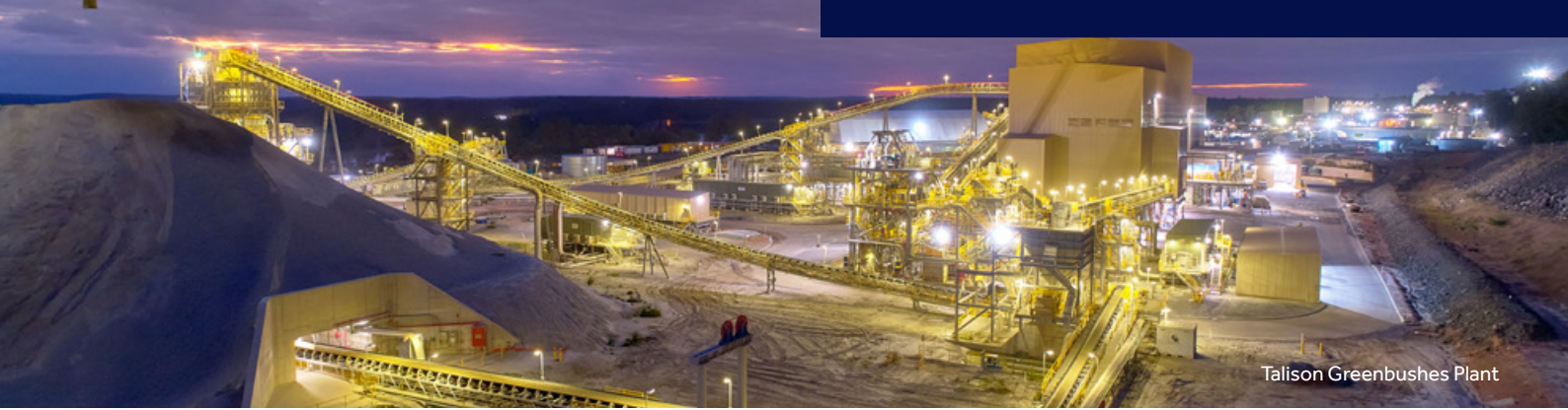
Talison Greenbushes Plant