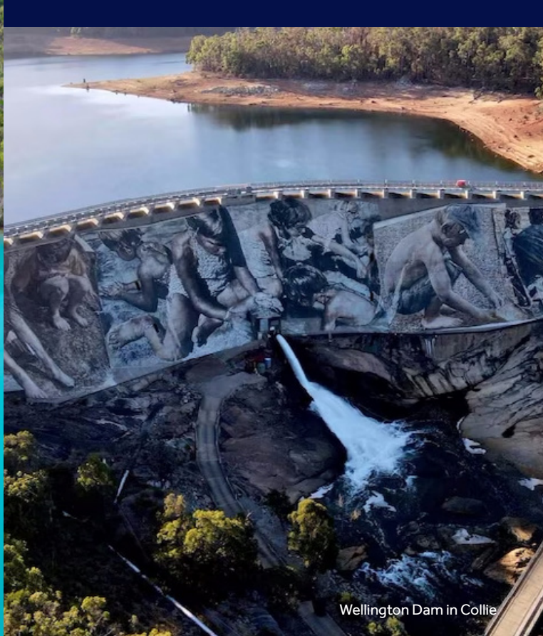
Wellington Dam in Collie