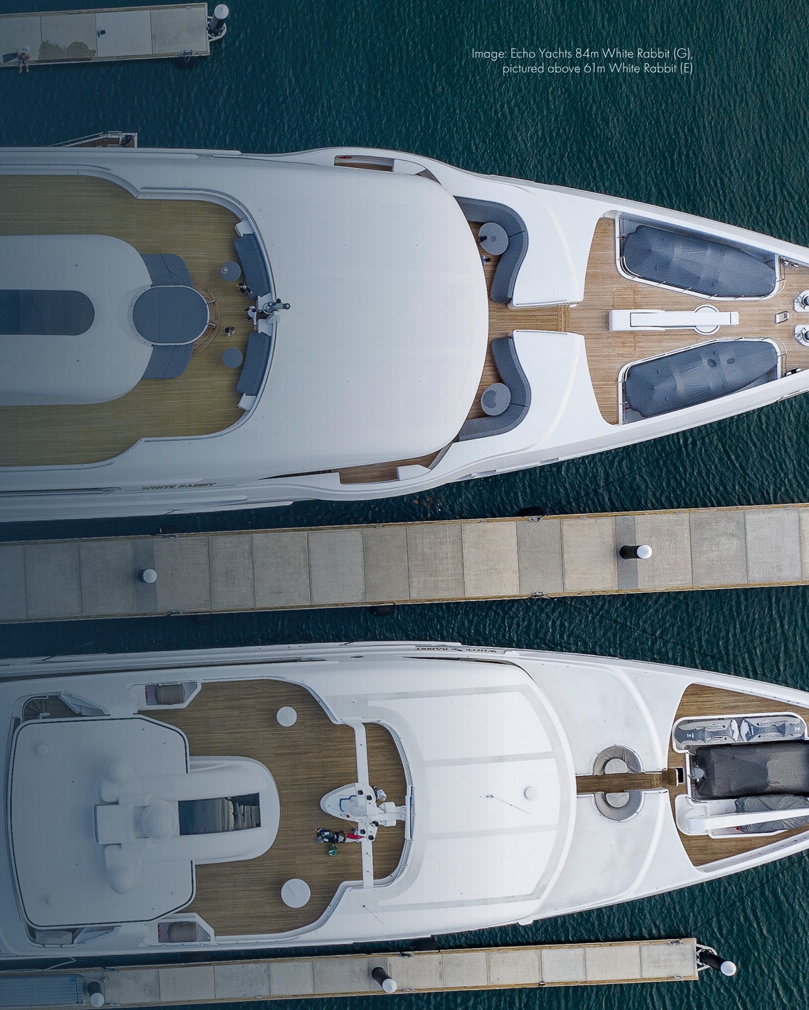
Image: Echo Yachts 84m White Rabbit (G), pictured above 61m White Rabbit (E)