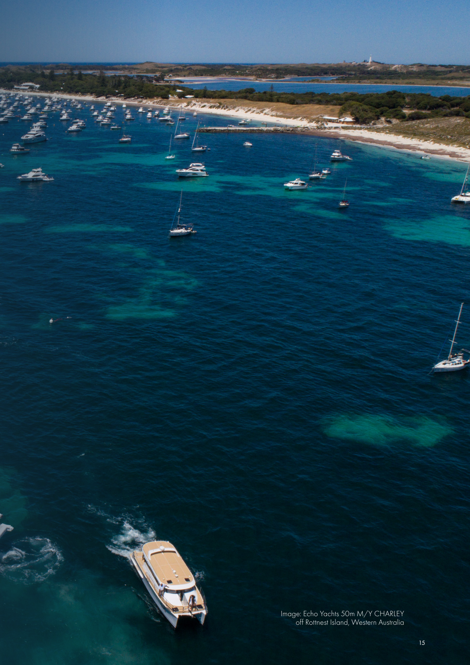
Image: Echo Yachts 50m M/Y CHARLEY off Rottnest Island, Western Australia