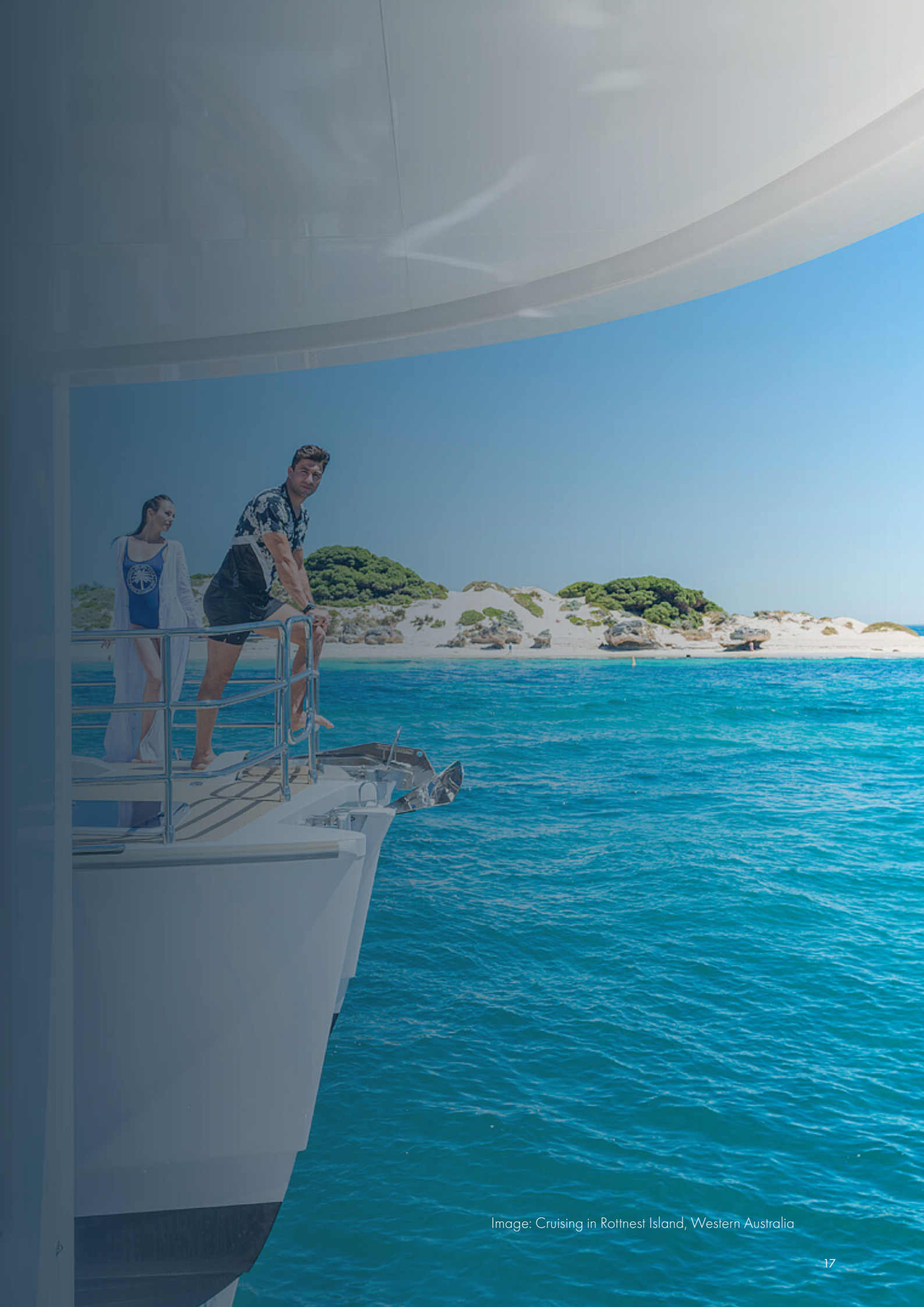
Image: Cruising in Rottnest Island, Western Australia