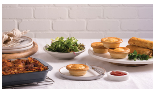
Ready to eat