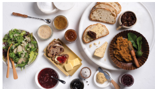
Condiments, preserves, dressings