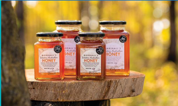
Products Jarrah honey

Marshall's Western Australian Honey is a family owned and operated apiary and honey wholesaler. From humble beginnings we have grown into an apiary of 70 hives, focusing on harvesting of mono-floral and active Western Australian honeys. Operating an apiary of this size allows us to undertake all aspects of beekeeping and sales.