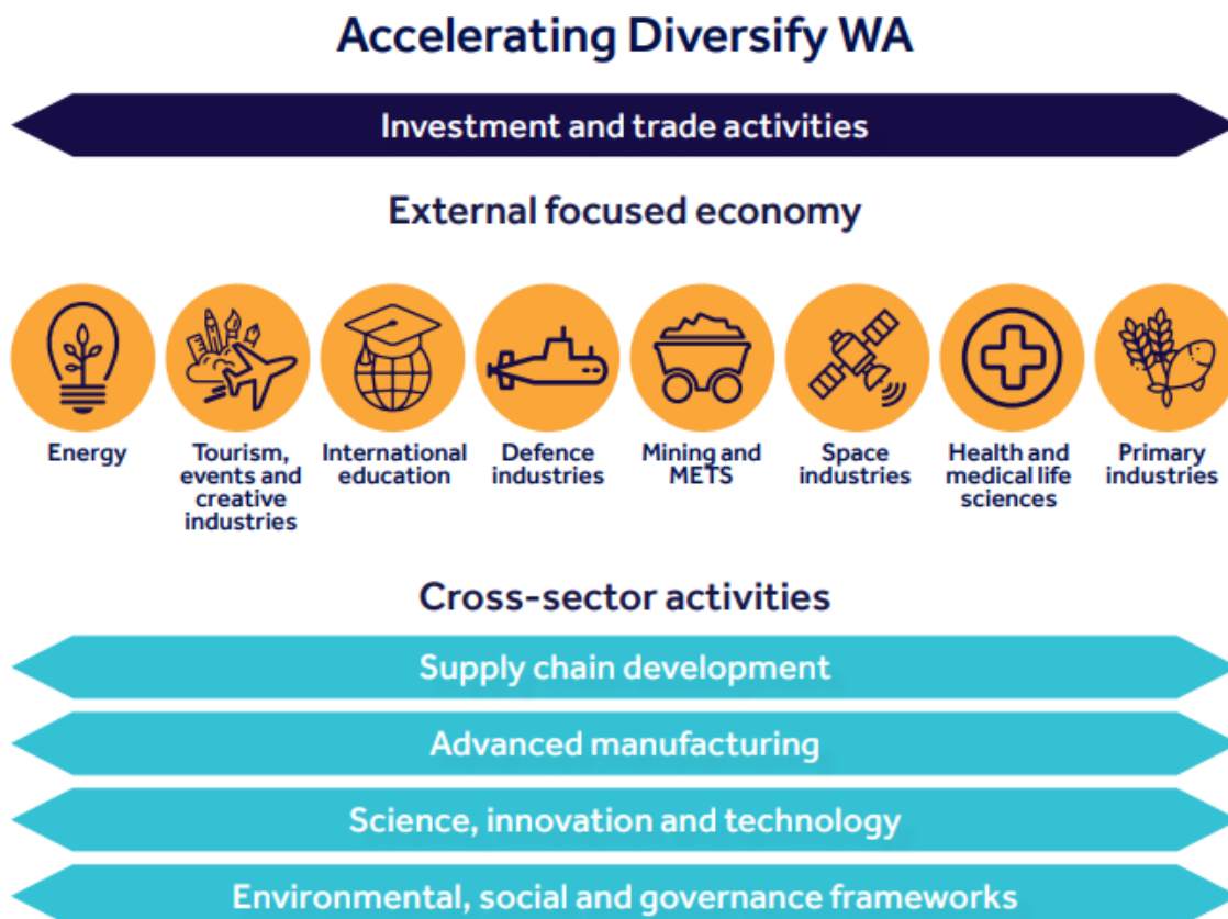
Figure 1. Priority sectors for strategic development in WA

Within the context of Diversify WA, the Plan aims to create a positive environment for industry to invest in supply chain activities by focusing on key enablers, including investment attraction.