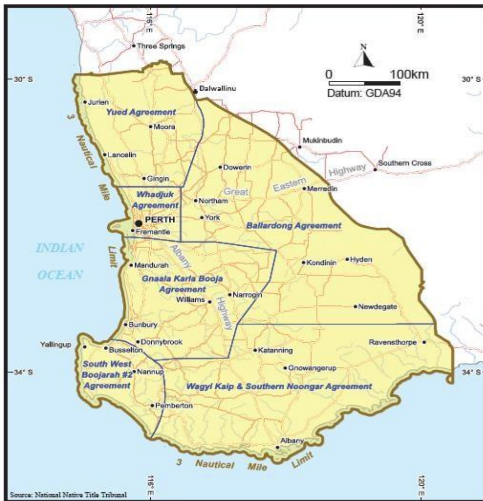
Map of the Settlement Area showing the six ILUA (Agreement) boundaries. A Regional Corporation is being established for each ILUA Area, to be supported by SWALSC as the CSC.

The South West Aboriginal Land and Sea Council (SWALSC) was formally appointed by the Noongar Boodja Trustee as the Central Services Corporation (CSC) on 29 June 2022, following endorsement by each of the six ILUA groups, and the WA Government. As CSC, SWALSC will support and assist the Regional Corporations to grow and develop by providing financial, administrative and corporate services.