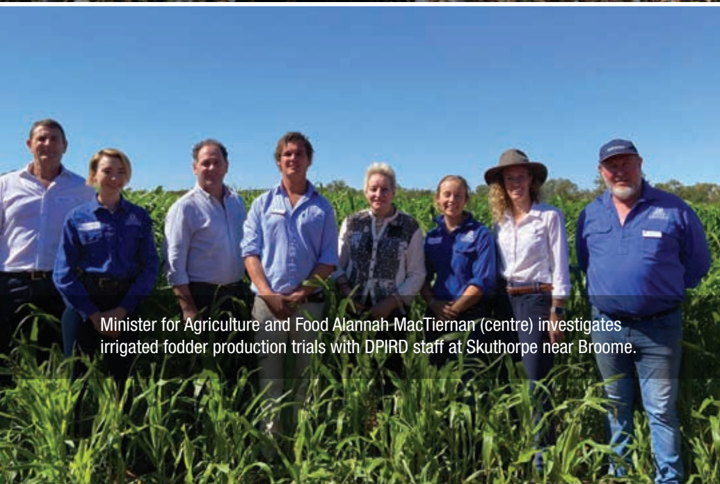
Minister for Agriculture and Food Alannah MacTiernan (centre) investigates irrigated fodder production trials with DPIRD staff at Skuthorpe near Broome.

Expanding the digital capacity of the state's primary industries remains a top priority for the government – with $8.1 million invested over four years in the successful eConnected program. At the heart of the project is a digital platform that integrates and delivers real-time weather data from a network of 187 automated weather stations across WA. The weather data is an integral resource for farmers, emergency services and the general public and facilitates the development of online agricultural decision-support tools.