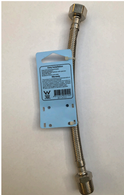
Photo 1: Shows correctly WaterMarked and labeled braided flexible hose.