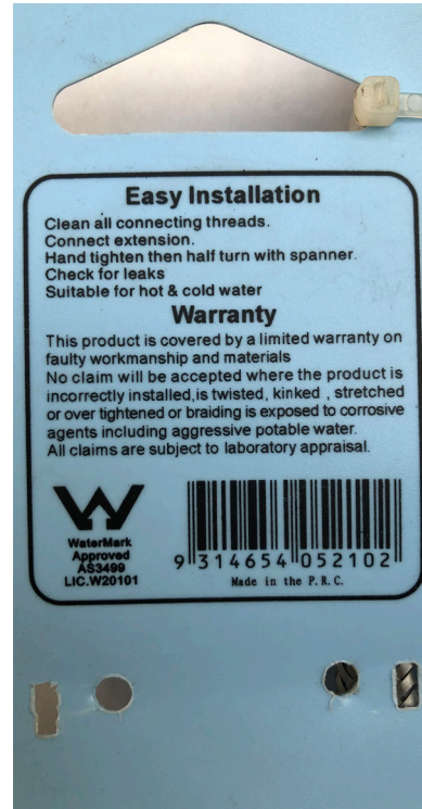
Photo 2: Shows requirements on label for correct installation of braided flexible hose. Note the WaterMark logo, applicable standard and licence number marked on the product.