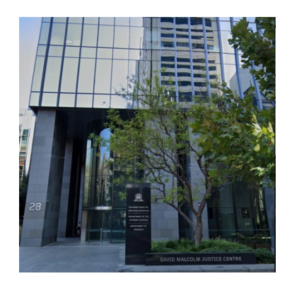
Visit us Department of Justice Level 23 28 Barrack Street PERTH WA 6000