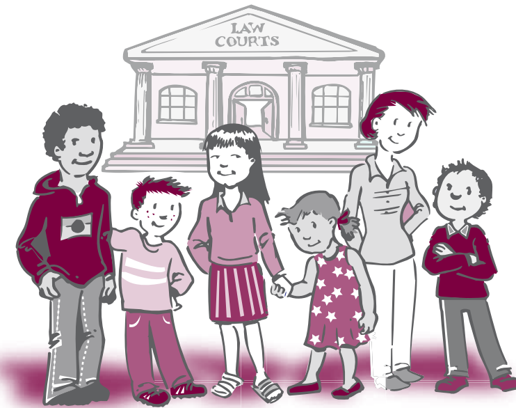
Court and Tribunal Services Division 095-09511009 | JAN17

Ongoing support and assistance will be provided until the matters before the court have been finalised.